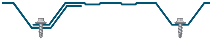
Figure 2: fixing at side laps and through valley